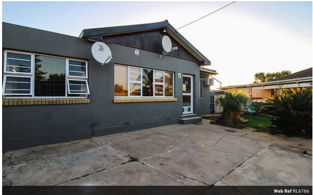
Web Ref RL6766