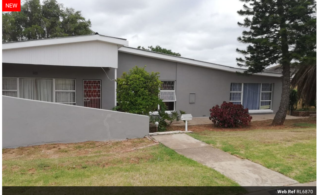
Web Ref RL6870